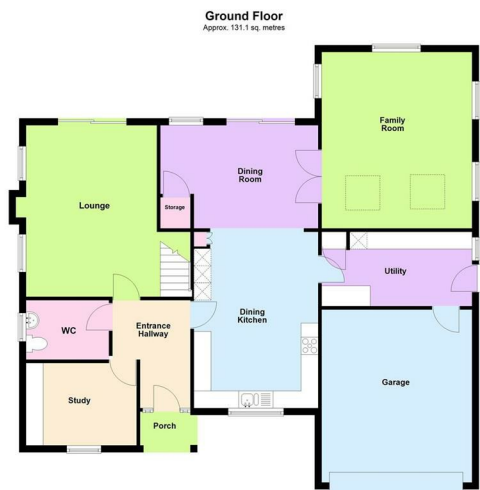
Total area: approx. 221.0 sq. metres